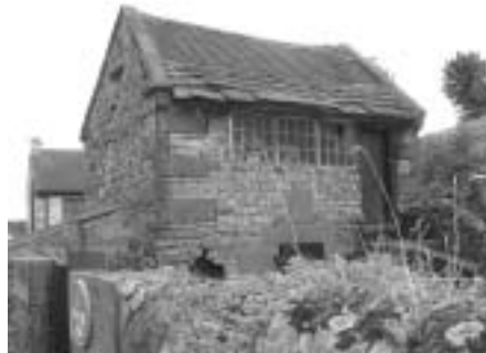
Bonsall Frame Knitters workshop, built 1737, one of our current projects.

so watch this space. We are currently researching alternative heating and insulation sources and intend to offer a workshop on the options available in the near future.