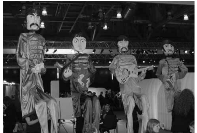
Beatles at Voice 08

www.kindertrespass.com celebrating the 75th anniversary of the mass trespass on Kinder Scout