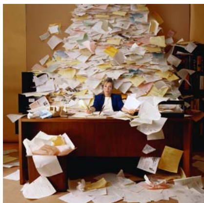
It's not QUITE this bad!