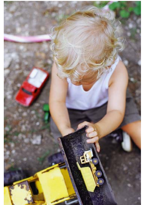
Learning through play is essential

If any other groups need help, guidance or just encouragement with their funding issues - we are here to help!