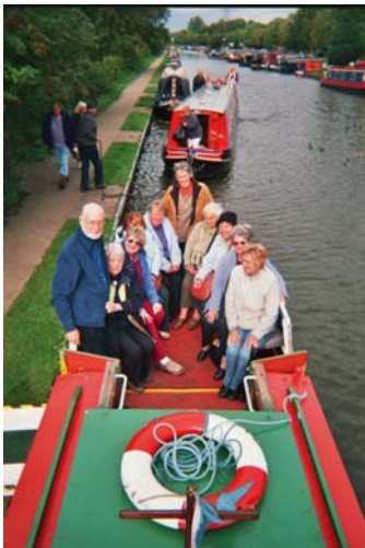
The group enjoying their canal trip

The group meet on the second Thursday of the month from 1.00 - 3.00pm. If you or anyone you know suffers from this debilitating and frustrating condition - why not go along to the meetings or you can contact the group on 0845 345 2638.